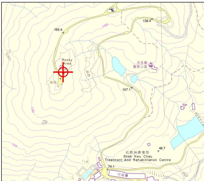
LOCATION MAP (Scale 1:5000)