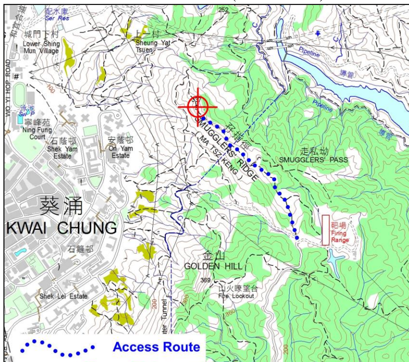
LOCATION MAP (Scale 1:20000)