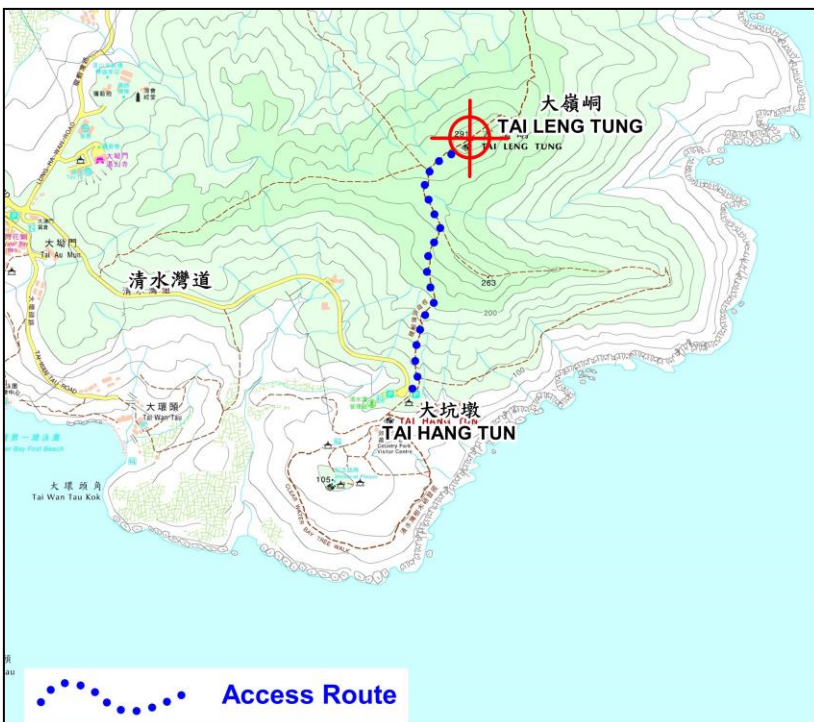
LOCATION MAP (Scale 1:20000)