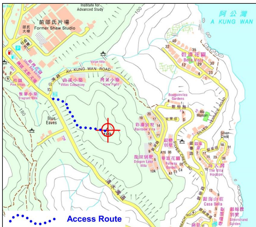
LOCATION MAP (Scale 1:10000)