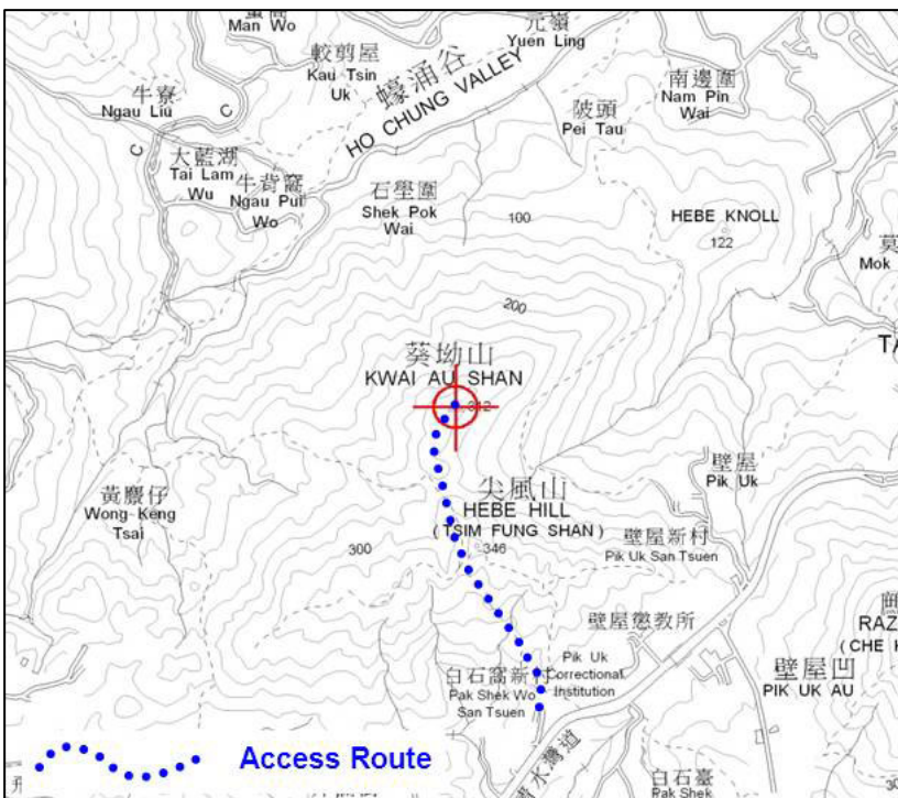
LOCATION MAP (Scale 1:20000)