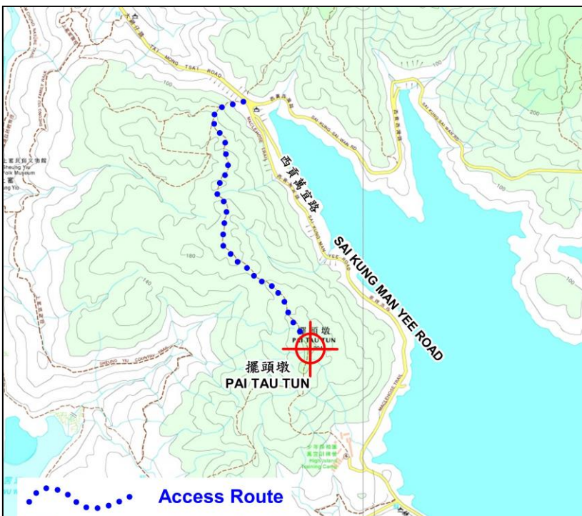
LOCATION MAP (Scale 1:20000)