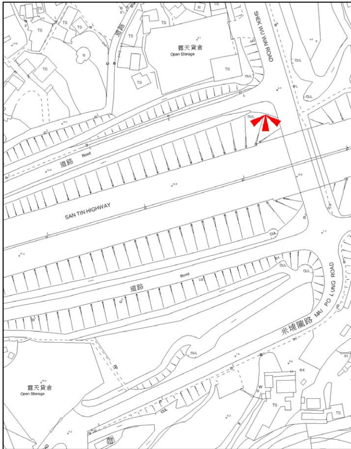
LOCATION MAP (Scale 1:2000)

Height above HKPD : 6.7805 m (Origin: 2013 levelling results) HK 1980 GRID COORDINATES (APPROX.): N = 839 379 m E = 825 172 m LOCALITY : SHEK WU WAI ROAD, SAN TIN SURVEY SHEET NO. : 2-SE-12B