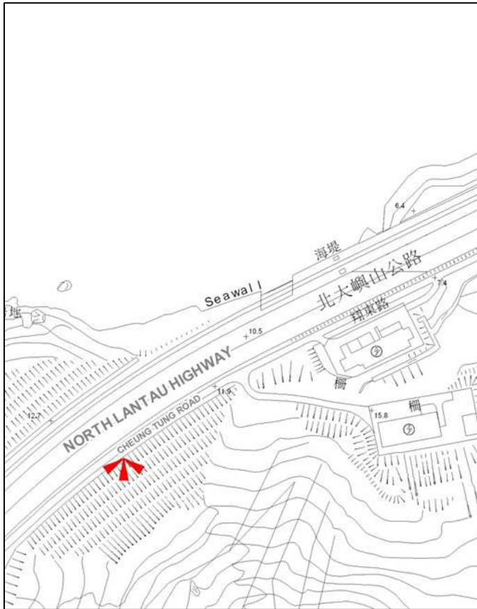
LOCATION MAP (Scale 1:5000)