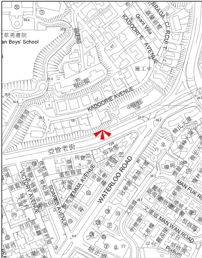
LOCATION MAP (Scale 1:5000)

Height above HKPD : 11.7850 m (Origin: 2013 levelling results) HK 1980 GRID COORDINATES (APPROX.): N = 820 195 m E = 836 187 m LOCALITY : ARGYLE STREET SURVEY SHEET NO. : 11-NW-20A