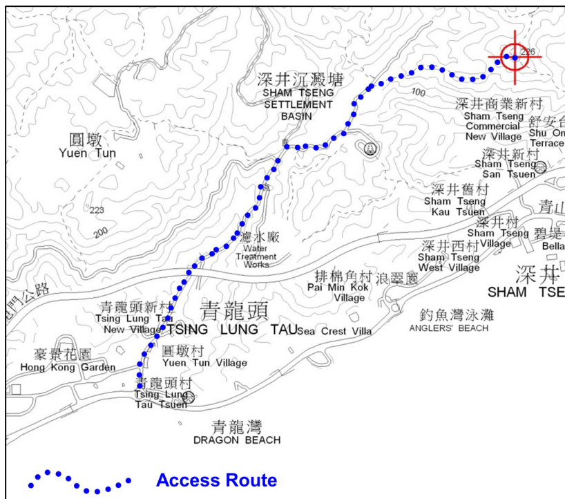
LOCATION MAP (Scale 1:20000)