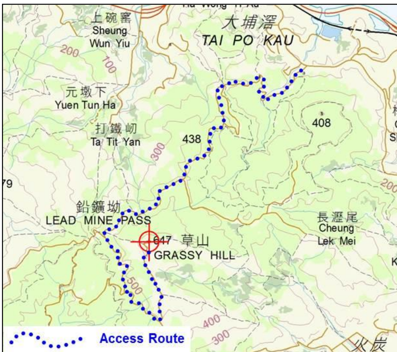
LOCATION MAP (Scale 1:50000)