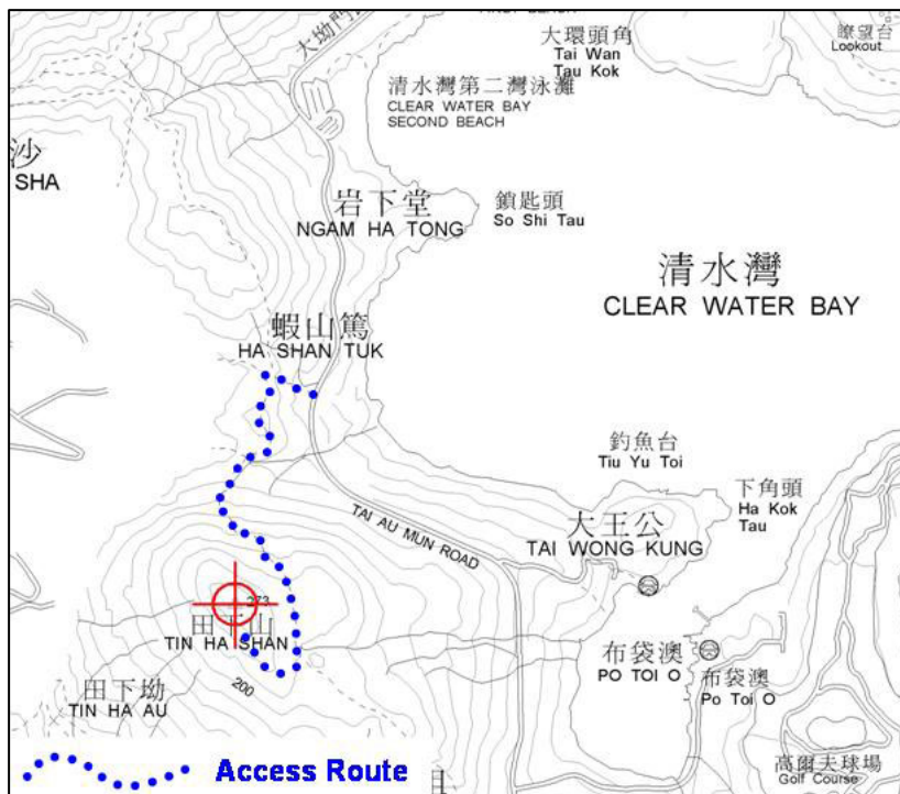
LOCATION MAP (Scale 1:20000)