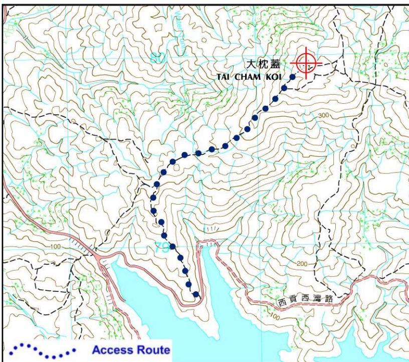
LOCATION MAP (Scale 1:20000)