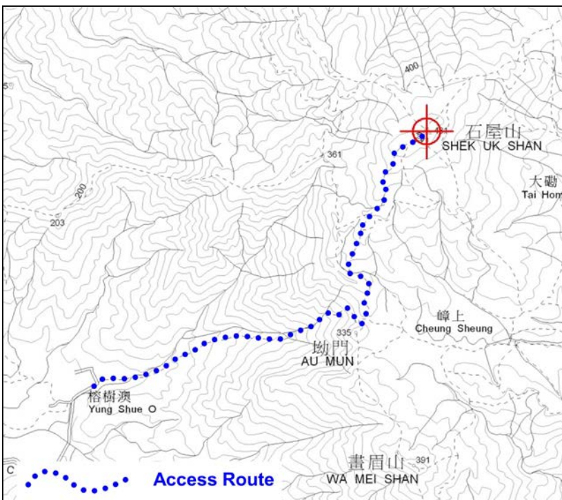
LOCATION MAP (Scale 1:20000)